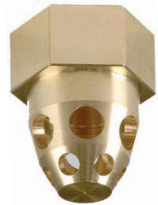
Fike Discharge Nozzle

Discharge nozzles are available in sizes of 1/2", 3/4", 1", and 1 1/2" (15, 20, 25, and 40 mm), which correspond to the distribution pipe threads feeding the nozzle. Each nozzle has 12 orifices and provides a 360-degree discharge pattern. The nozzle is equipped with a customized orifice plate to provide accurate inert gas flow results. The ProInert Flow Calculation Program specifies the required orifice plate. The orifice size is stamped on the nozzle body.